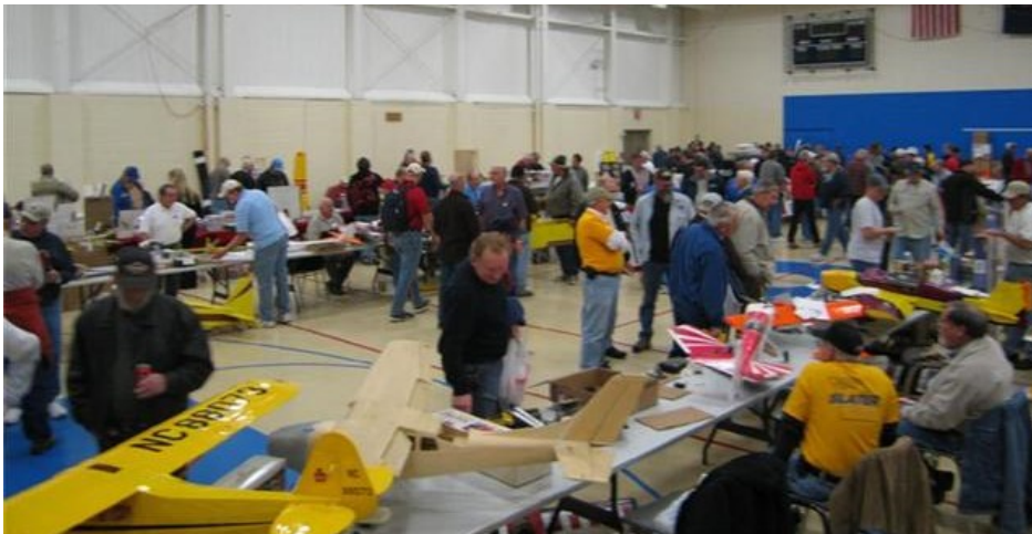
Major activity at the 2009 Swap N Shop