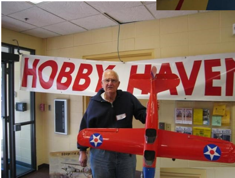
Prize winners at the 2009 Swap N Shop