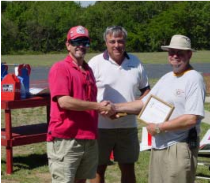
Pilot's Choice Award