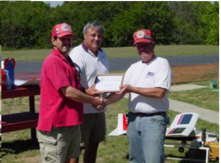
Best Military Award